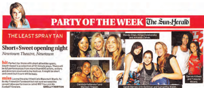
Social photos from Short+Sweet premiere as published in the Sun-Herald

These are opening night guest foyer shots which can gain you extra coverage in the 'social' pages of the press. Try to include VIPs or celebrities of note and perhaps some shots of the cast and crew mingling in the 'afterglow' of a great premiere!