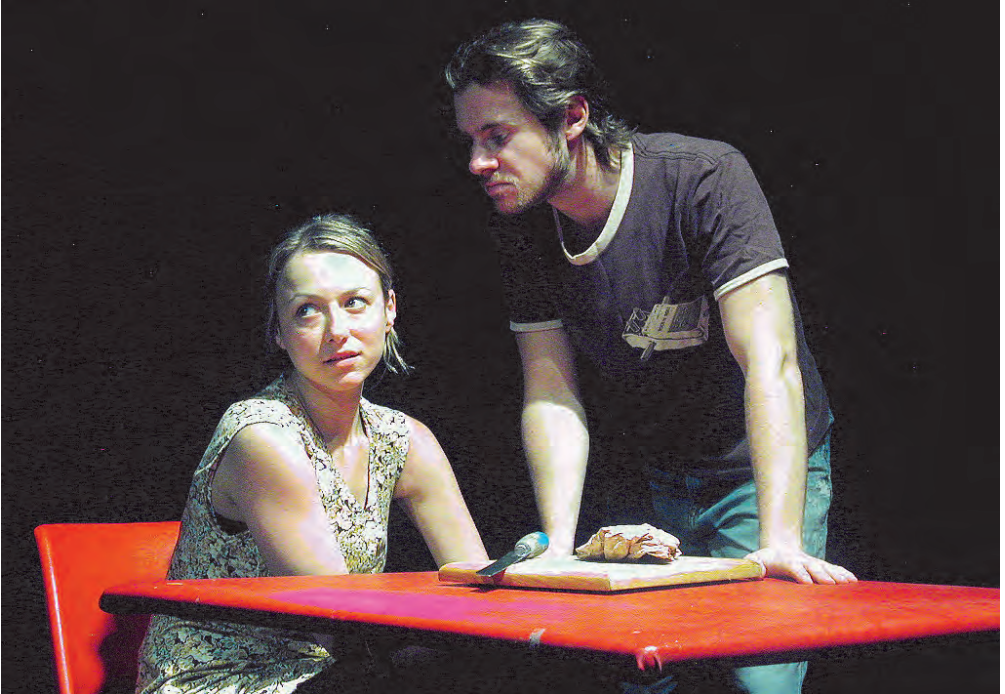
Publicity photo for Below

If it's possible to call them, do so. If you can be there in person to greet and explain at the theatre box office, do so. Polite, apologetic signage in the theatre is a minimum and should always give a contact for more information. It's not just courtesy, it is also your legal obligation!