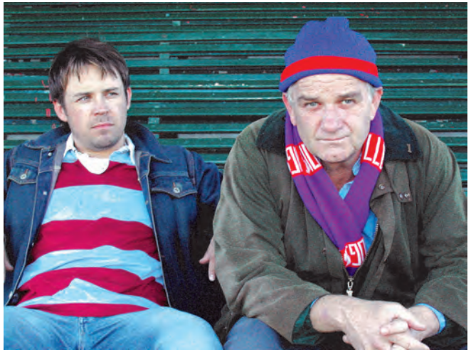
In character publicity photo for The Prince of Brunswick East

Your publicist's contacts are their valuable possession, gleaned over years by dedicated attention to the task and maintained by constant communication and painstaking updates. Please don't ask your publicist to hand them over as they are unable to do so for matters of intellectual and professional property.