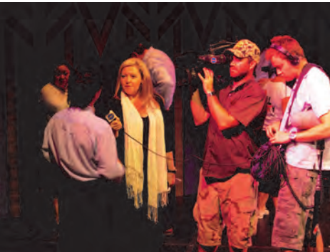
WTC's The Full Monty on Channel 10 News

A publicist arranges press articles, radio and TV interviews, 'what's on' listings in the press and on the internet, reviews and feature articles. The benefits are obvious - especially for companies whose budget will not stretch to expensive advertising.