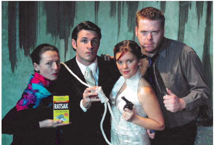
Publicity photo for The Bridesmaid Must Die

special interest. For example, new work, Australian or world premieres are extra-newsworthy, as is the debut of new or young artists. High profile artists and celebrity involvement is also likely to attract extra media attention.