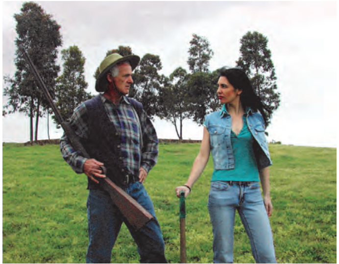
Promotional photo for Newtown Theatre's Fencelines

Your publicist is the messenger between your production and the media. He or she takes your briefing information and images or recordings of the show, details about its creators and its artists and seeks to place stories with newspapers, magazines