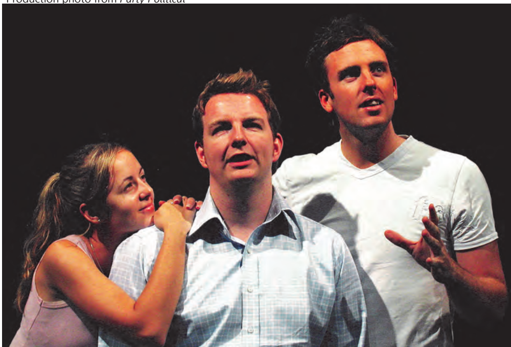
Publicity photo for Tick Tick Boom!