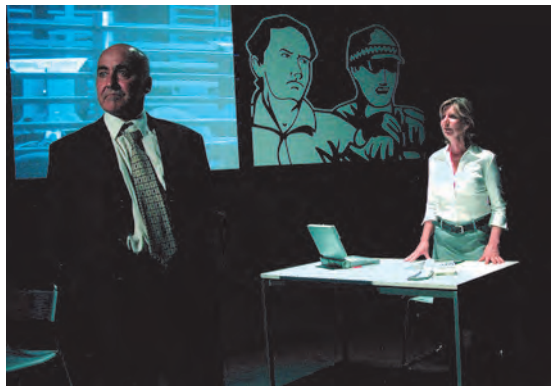
Production photo from Political Fiction

There's nothing worse than leaving this important work undone and then finding - all too late - that you've dropped the ball. By then, it may be far too late to get the word out - and you've not done justice to the efforts of your cast and crew. So, don't think you can't afford a publicist... you can't afford not to have a one!