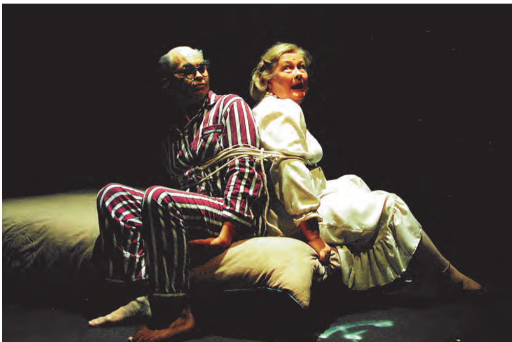
Production photo from Party Political