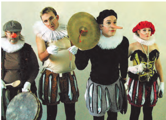
Publicity photo for The Popular Mechanicals

types of media and will need to offer most outlets plenty of notice. For example, while radio producers tend to work 7 days ahead at most, glossy colour magazines may be filled months ahead of publication date. Daily newspapers may still have room in their front news sections less than 24 hours ahead but their gig guides and lift-outs generally have deadlines at least ten days ahead of publication. Websites may be able to list events overnight, but local press editors plan their arts stories often two to four weeks ahead. In any case, long advance notice never hurts so give your publicist the best chance to do their best for you.