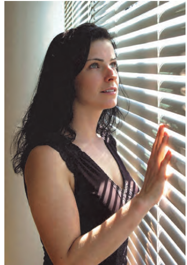
Publicity photo for Beginner at Life

Your publicist is in a good position to advise whether an additional approach from the producer will be useful or counterproductive. "Good Cop / Bad Cop" might work in TV crime shows but can be a dangerous thing to attempt with the media. Sometimes a reasonable complaint, a special request or even a demand is worth making... politely. But be careful before you jump in boots and all!