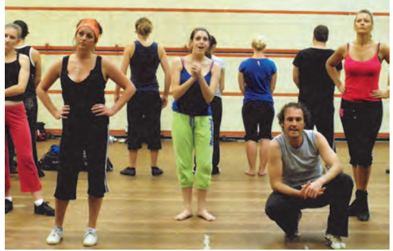
Rehearsal photo from WTC's A Chorus Line

In addition to this, some press will want to take their own photos. If they are prepared to do this, you should jump at the opportunity since this just about guarantees a large feature article (press rarely 'waste' photos they have spent time and resources taking). It is always worth the trouble of setting up a photo shoot with key cast in an appropriate setting. Your publicist can advise you of the sort of venue or setting that will be suitable. Again, be open to the preferences of the press... it will be to your advantage to give them what they want! Finally, be aware that few journalists or press photographers are available to attend rehearsals outside of normal business hours.